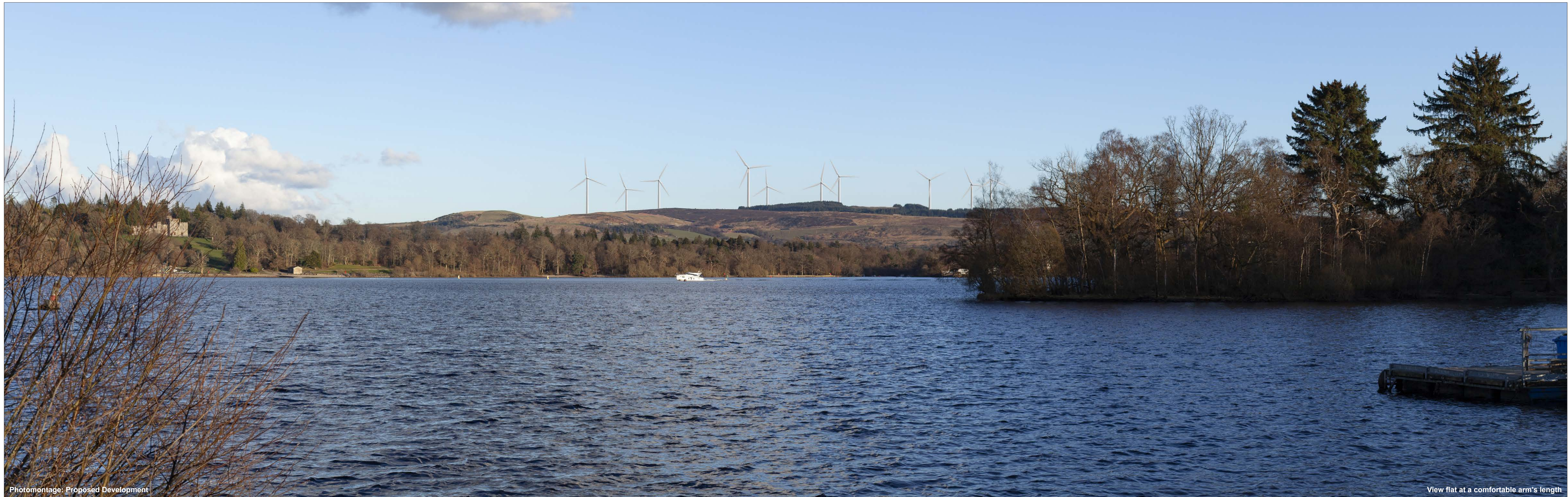
Photomontage: Proposed Development