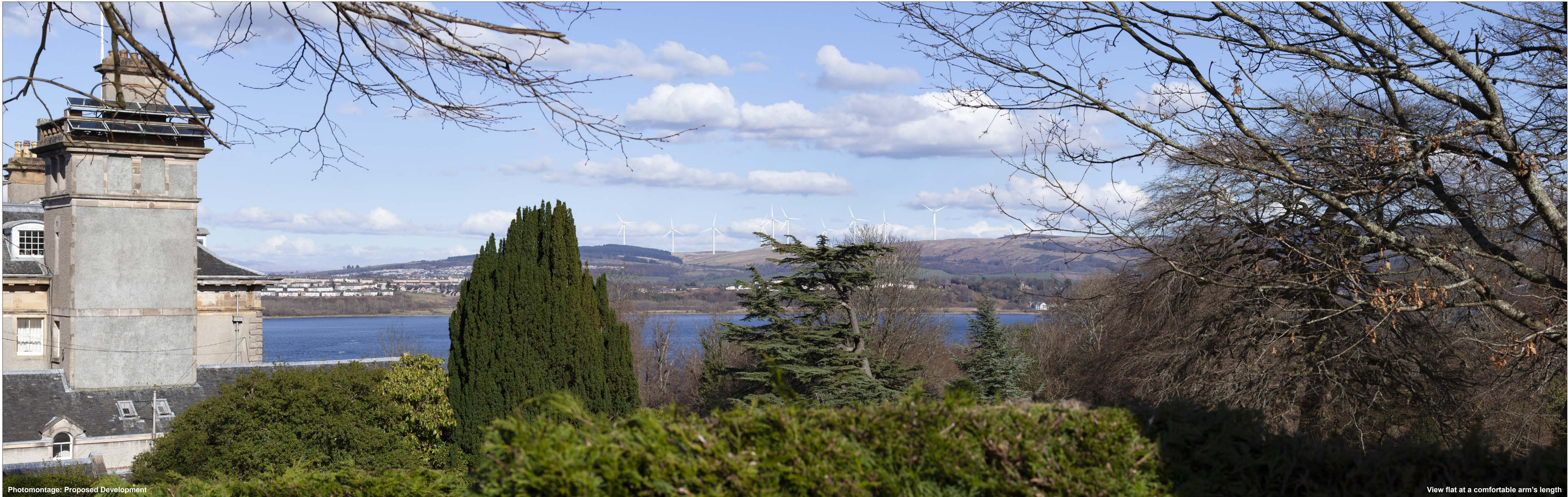
Photomontage: Proposed Development