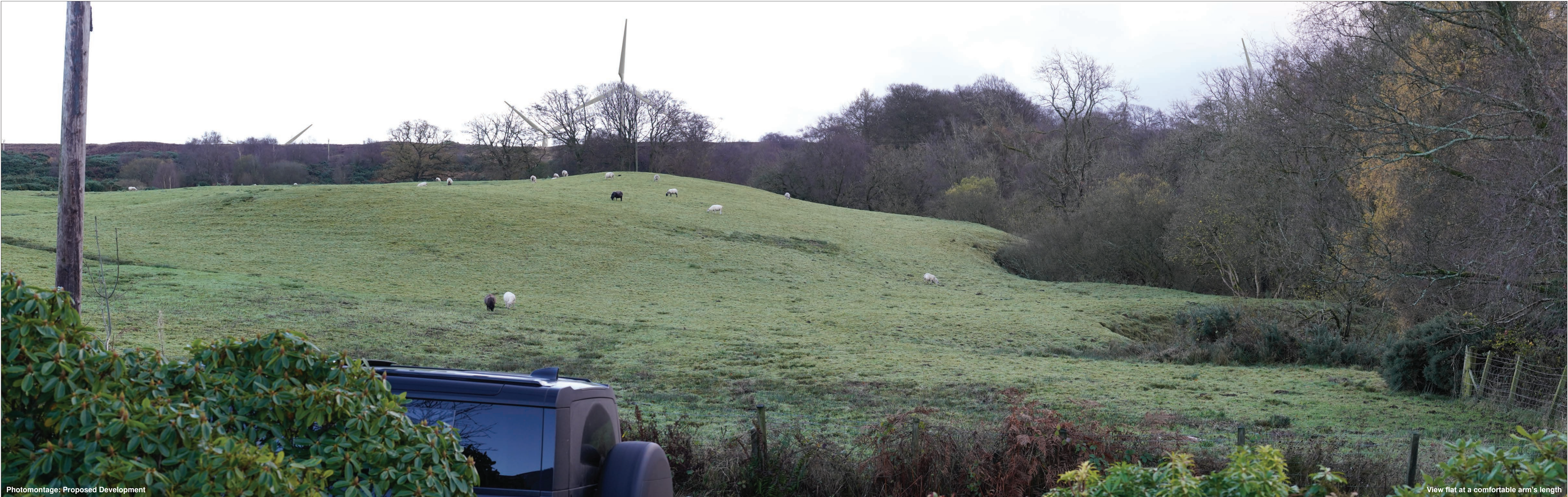
Photomontage: Proposed Development